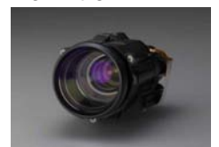
Full HD Lens

10x zoom non-spherical lens has been developed to maintain compact body size. It captures 2400x1800 pixels still photo as well as 1920x1080 full high-definition video. The lens is multi-coated to prevent reflection, flare, or ghost images, and has gradation ND (neutral density) filter to prevent degrading of resolution caused by aperture of iris.