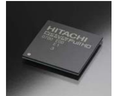
High Quality Audio/Video Codec LSI

ii) “High Quality Audio/Video Codec LSI” has a uniquely developed algorithm for high-quality motion picture. It switches process methods between field and frame in macro block depending on the amount of motion happening within the frame to process fine quality video image in scenes with a lot of action. The unique algorithm adaptively judges and switches encoding methods depending on the condition of images judged by the correlation of different frames, or predictions made from a single frame. The algorithm judges the amount of code to allocate by calculating how much picture quality deterioration can be recognized at playback.