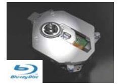
8cm BD/DVD Drive