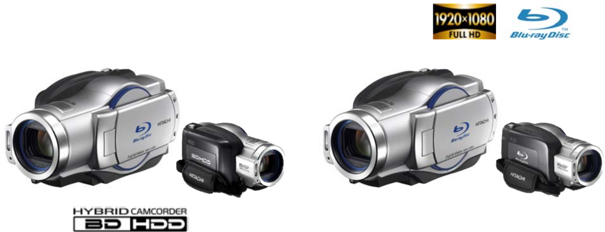
8cmBD/DVD Drive+30GB HDD Cam DZ-BD7H