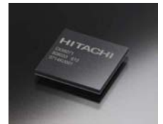
High Definition Camera Image Processing LSI

(3) “Picture Master Full HD” High Resolution Image Processing Engine consists of “High Resolution Camera Image Processing LSI for Full High Definition” which effectively processes the massive data captured by the 5.3 mega pixel CMOS image sensor, and “High Quality Audio/Video Codec LSI” which implemented MPEG4 AVC/H.264 CODEC, which is 1.5 to twice efficient compared with MPEG2.