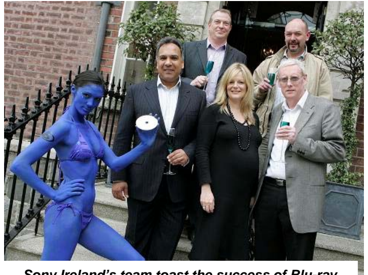
Sony Ireland’s team toast the success of Blu-ray

"Blu-ray has been and will continue to be a core part of Sony's 'HD World' strategy. We will continue to promote the benefits of HD throughout the value chain including Blu-ray products, BRAVIA LCD TVs, PLAYSTATION 3, VAIO PCs,