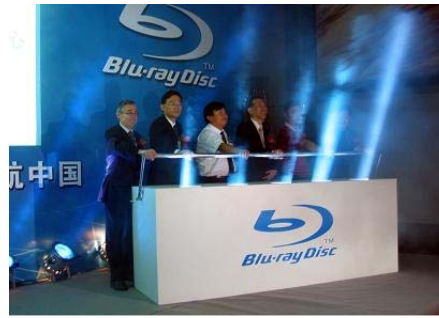
BDA and CESI representatives celebrate the establishment of China's first authorized BD testing center

Matsumura-san is enthusiastic about Blu-ray's long-term potential in China. "Again, the huge population and tremendous economic growth offer unmatched market potential," concluded Sumitaka Matsumura. "I see similar trends to Japan, the U.S., and Europe in terms of the increase in large-screen TVs to accommodate High Definition content and the influx of digital broadcasting. These trends in China are currently slightly behind other regions, but already, we are seeing sharp increases in the uptake of