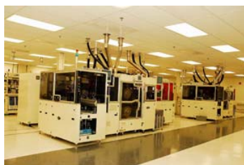
Blu-ray Disc replication at Sony DADC

Up to now, Sony DADC has produced 500 titles and over 12 million Blu-ray Discs