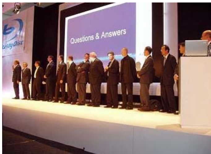
Senior Hollywood Studio executives answer journalist questions at IFA