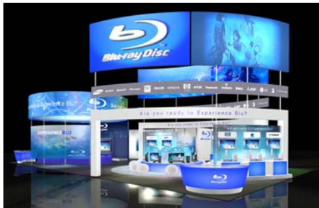
An artist's impression of the BDA CES Booth