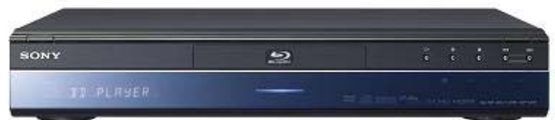
BDP-S300 - highest quality at a popular price

The new BD player is compatible with most standard DVDs and has the added feature of 1080p upscaling through HDMI to 1080p capable HDTVs, improving the picture performance of existing DVD libraries.