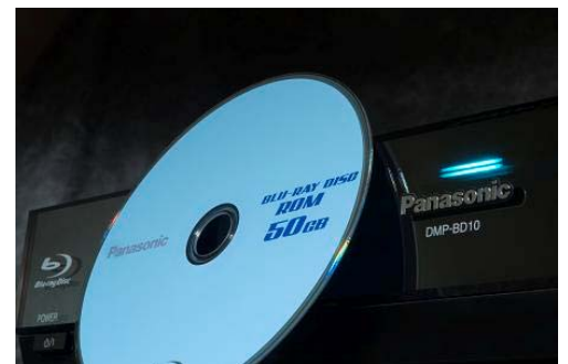
Panasonic brings BD know-how to Hollywood's creative community