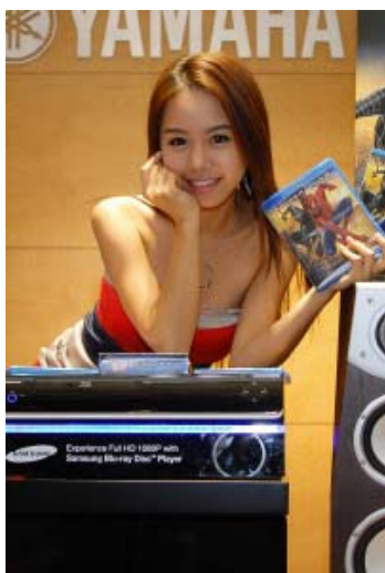
COEX in Seoul provides Korean BD showcase

forged a strategic partnership with the Japanese company to launch an Internet-based TV service based on PLAYSTATION3 console next month.